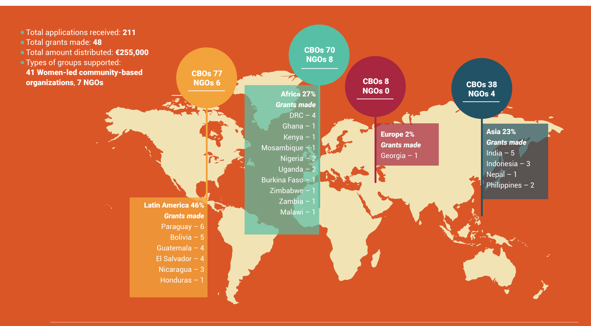
<sup>2</sup> Africa: Fonds pour les Femmes Congolaises, Global Greengrants Fund, Urgent Action Fund Africa, Women's Fund Tanzania; Asia: Keystone Foundation, Mongolian Women's Fund, Non-Timber Forest Exchange Program (NTFP-EP), TEWA - Nepalese Women's Fund, Women's Fund Asia; Europe (Georgia): Women's Fund Georgia; Global: FRIDA - Young Feminist Fund, International Indigenous Women's Fund (FIMI), Mama Cash; Latin America: Fondo Centroamericano de Mujeres, Fondo de Acción Urgente – América Latina y el Caribe, Fondo de Mujeres de Bolivia - Apthapi Jopueti, Fondo de Mujeres del Sur, Fondo Tierra Viva, Fondo Socioambiental CASA.

the success of the ARF, which rapidly moved vital resources to women environmental defenders and their communities. In a period of just six weeks, GAGGA received a total of 211 applications, including 193 from women-led community-based organisations and 18 from GAGGA's NGO partners.